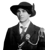
The World Chief Guide